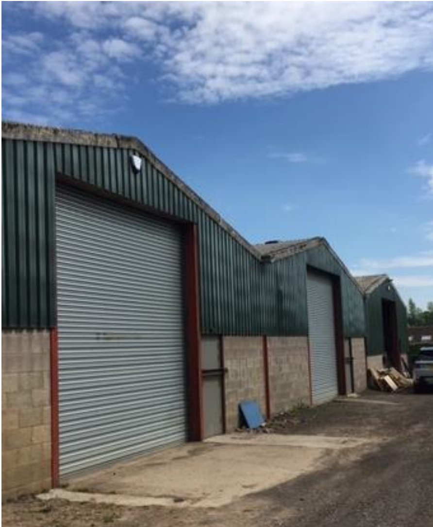
Units 1, 2 and 3