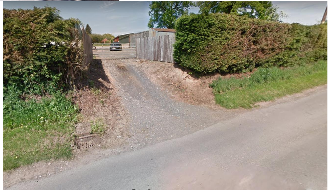
Secondary access from Dusthouse Lane