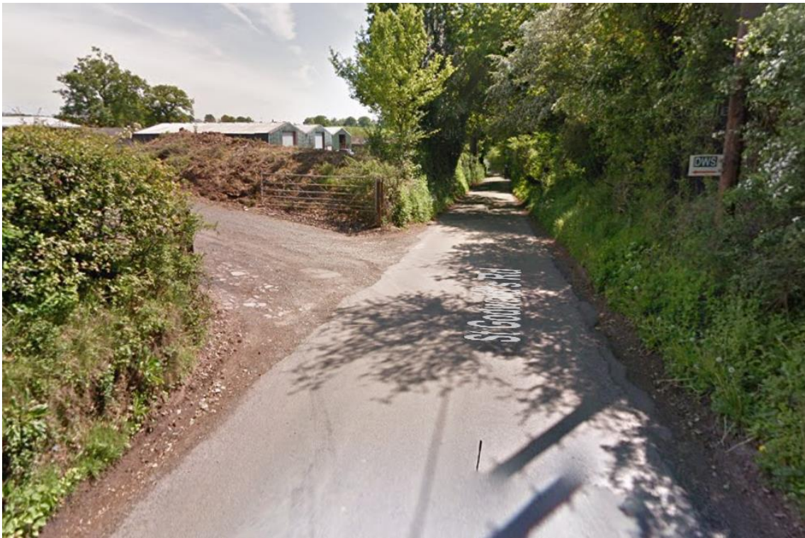
Primary access from St Godwald's Road